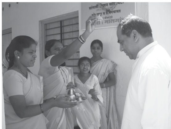
St. Joseph's Church, Kodoli, Kolhapur