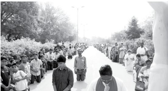
St. Peter's Parish, R K Puram