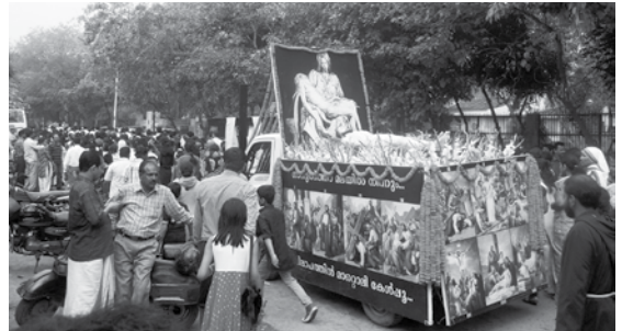
St. Francis of Assisi Parish, Dilshad Garden