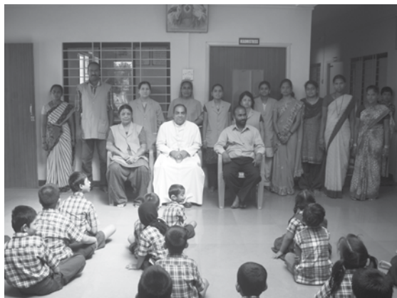
Aakshadeep Special School and Family Counselling Centre Sangli