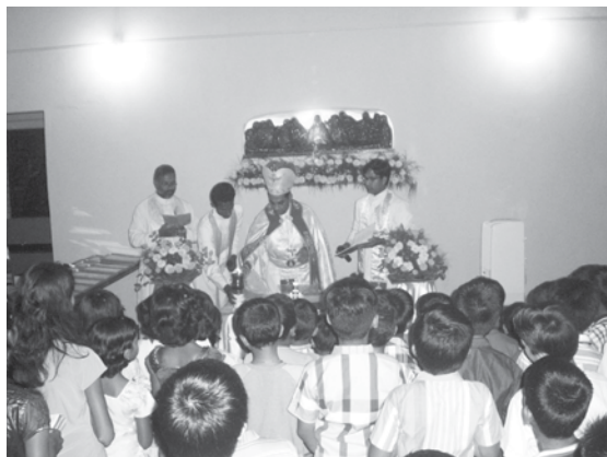
Blessing of Divyajyothi School Banda, Border to Goa