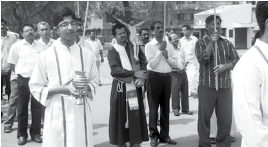
St. Francis of Assisi Parish, Dilshad Garden