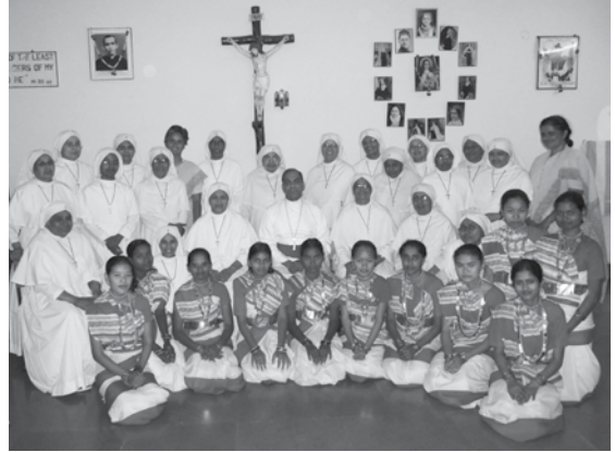
SD Sisters' Superiors meeting at Pushpadham Provincial House, Najafgarh, Delhi