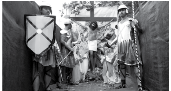
Our Lady of Fatima Parish, Okhla