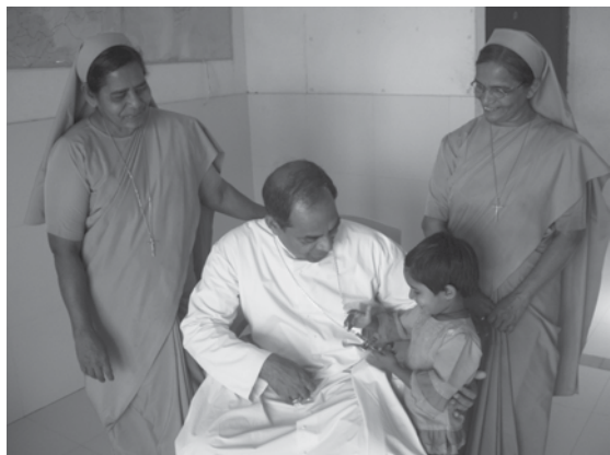
Visiting Dilasa House of Hope for aids children, Meeraj, Sangli