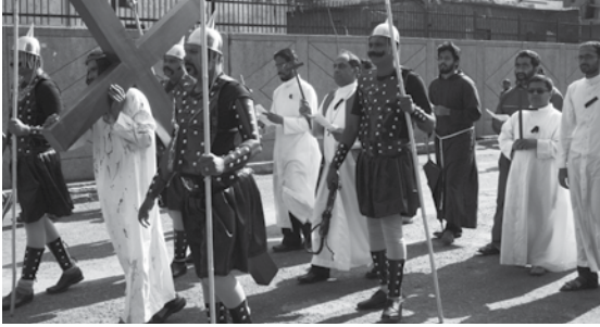
Assumption Parish, Mayur Vihar - I