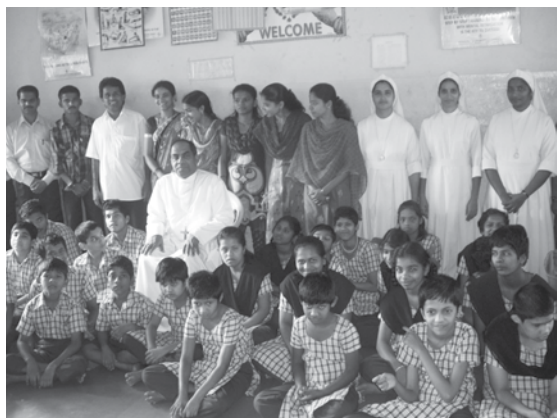
Jeevandhan Special School, Zarap