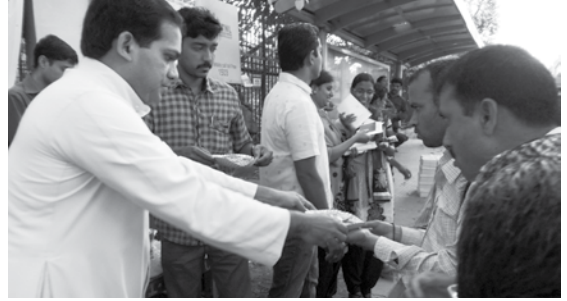
St. Augustine Parish, Karol Bagh