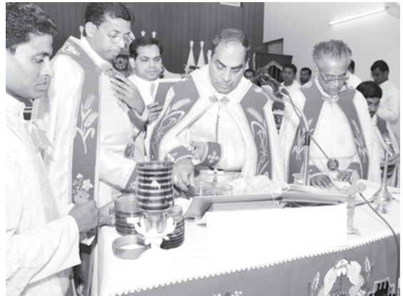
Archbishop blesses Chrism during the Chrism Mass