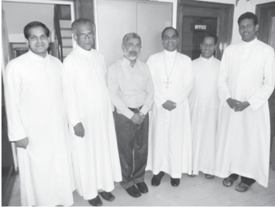
Justice Kurian Joseph visited Faridabad Diocese Bishop's House