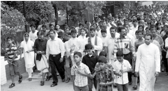
Our Lady of Fatima Parish, Okhla