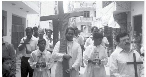
St. Thomas Parish, Janakpuri